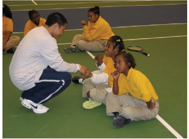
Above: Students from Pepper Middle School participating in Life Skills activities