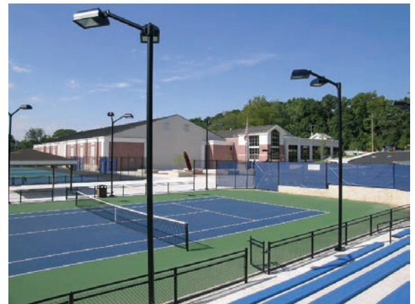
Above: Exterior view of new AAYTE facility

New this year is the “ Love to Serve ” program. Immediately after school, over 30 children from at-risk neighborhoods get supervised homework help at local recreation centers. Then they board a bus for the short trip to the center where they receive tennis instruction, Life Skills, dinner, and supervised educational activities before returning home.