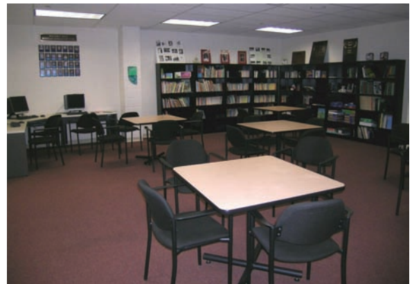
Below: Reading is Fundamental library