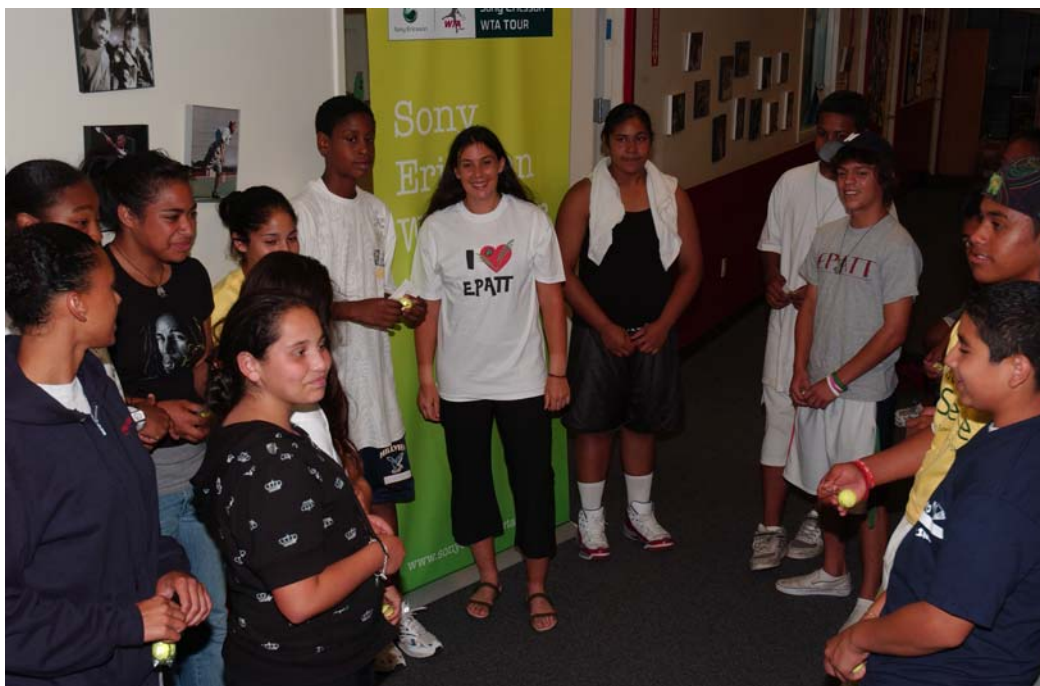
2007 Wimbledon Finalist, Marion Bartoli visits with First Serve kids at EPATT. See story inside.